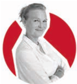
HEAD OF THE UNIVERSITY STUDENT SERVICES CENTRE

» https://www.th-brandenburg.de/studienabbruchberatung/