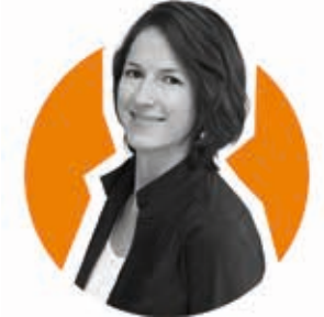
FACULTY OF BUSINESS AND MANAGEMENT

The working method is characterised by small groups in the higher semesters and individual support for students by qualified academic and technical staff.