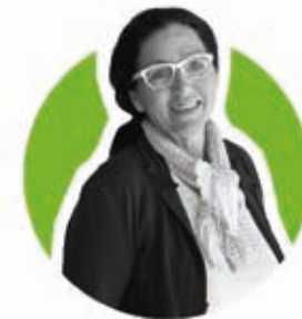
FACULTY OF ENGINEERING

The extensive research and development work at Brandenburg University of Applied Sciences is carried out mainly in cooperation with companies. This ensures that the faculty provides a very practice-oriented education, both in its own laboratories and in collaboration with industrial and external research partners.