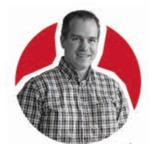
UNIVERSITY SPORTS OFFICER

» https://www.th-brandenburg.de/leben/sport/